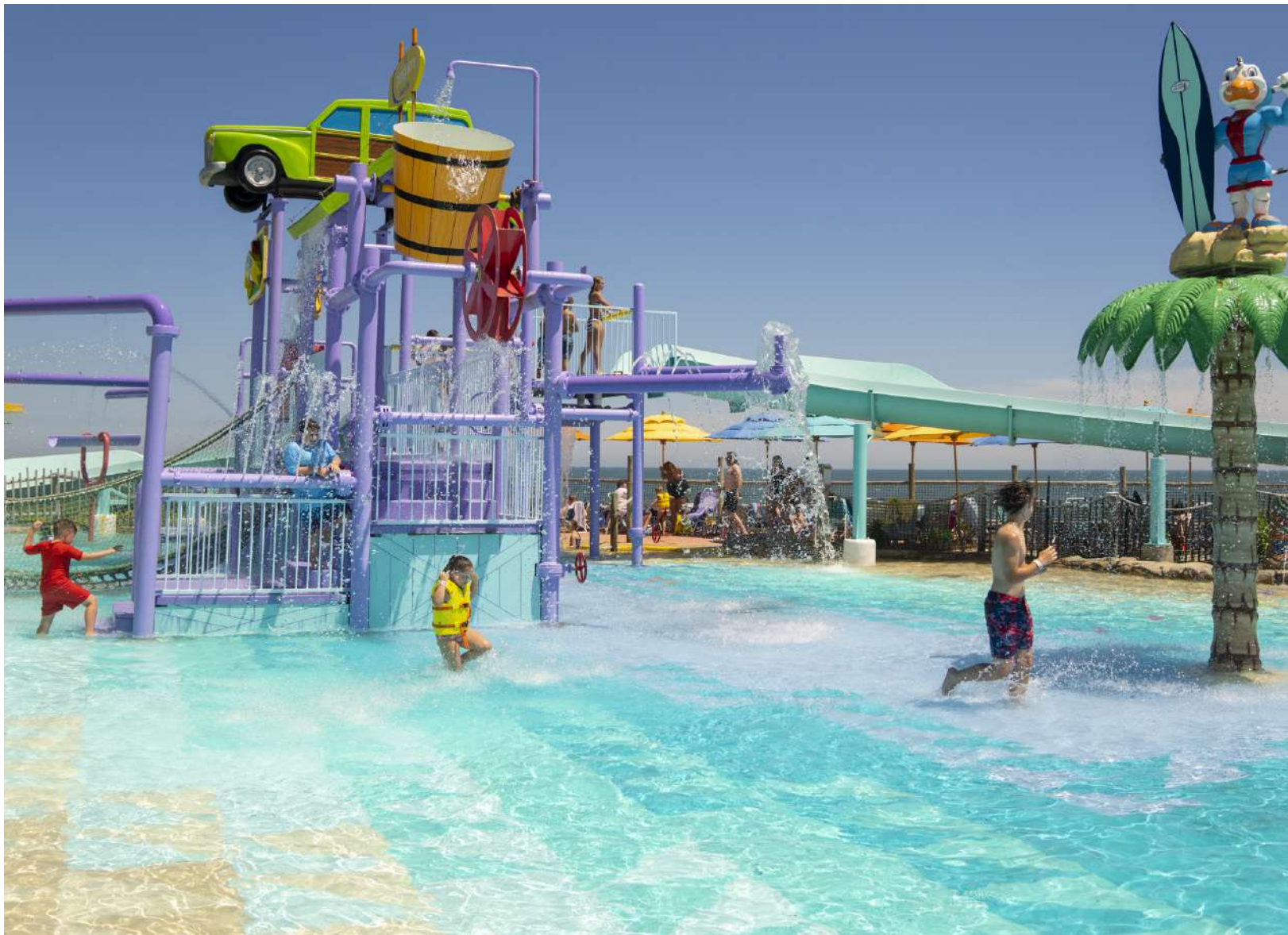
Inlays + Play Features