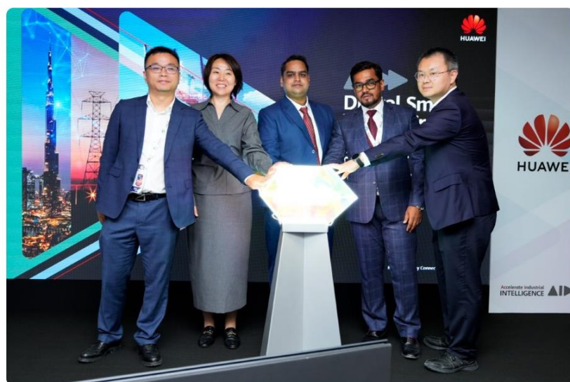
Huawei and customer and partner jointly launched Smart Hotel All-Optical Network Technical and Application White Paper

" We look forward to working with the industry to fully explore the technical application of the FTTO all-optical network solution in the hotel industry and further promote the intelligent transformation of the hotel industry," he concluded.